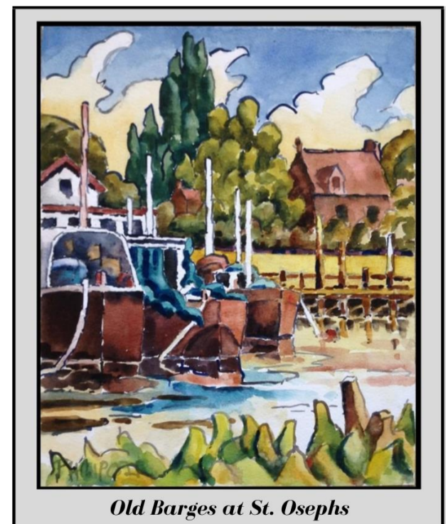
Old Barges at St. Osephs

But there was the wealth, certainly enough to give away without the givers being in anyway threatened. So, socialism was born and heralded in by all as the new utopia, and in the first half of its life it did an awful lot of good in helping the poorer sections of the community who had been overly exploited when helping the wealthier sections of the community to become rich.