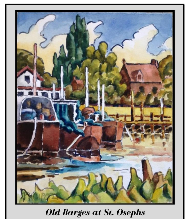
Old Barges at St. Osephs

But there was the wealth, certainly enough to give away without the givers being in anyway threatened. So, socialism was born and heralded in by all as the new utopia, and in the first half of its life it did an awful lot of good in helping the poorer sections of the community who had been overly exploited when helping the wealthier sections of the community to become rich.