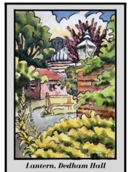
Lantern, Dedham Hall