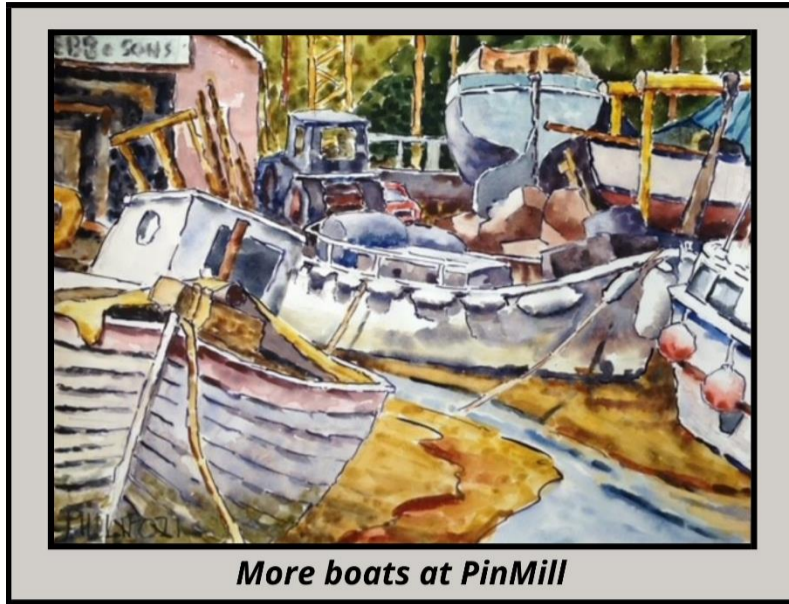
More boats at PinMill

And one of the best things that happened was the vastly increased provision of free education by The State. And quite unusually, by the middle of the 20th century, some of the 'free education' provided by The State was even overtaking, in academic terms, the private education that only the wealthiest in the country could afford. The State Grammar Schools were beginning to overtake the Etons and Harrows of this world. And because the top Universities like Oxford and Cambridge reserved most of their places for only the top private schools, the academic cream from The Grammar Schools ended up in what were called 'the red brick' universities scattered throughout the rest of the country. And guess what ??...very soon the red brick universities were beginning to outperform the Oxbridge's of this world. Which in turn forced the Oxbridge's to widen their intake of graduates, making more room for the best brains coming from The State Grammar Schools.