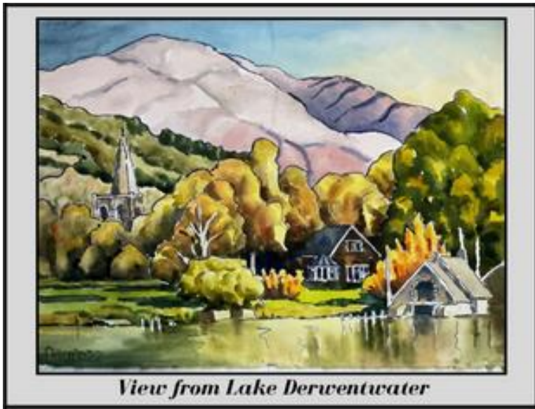
View from Lake Derwentwater

party, then we must use 120% of our focus and ability to stay out of the way of the stronger and more dangerous party in order to survive.....yet these new laws are doing the absolute reverse...they are more or less suggesting that the predators and the prey should swap places....try working that one out....).....well....I enjoyed getting all that out of my system.....and that feeling alone assures me that I am definitely part of nature on this Earth.....!.....in truth, I think most of us would agree that we humans today are spending far too much time worrying and exaggerating our own emotional hurts caused by words alone, (and in doing so creating our own new disease known as mental health) while spending far too little time taking note of the real physical hurts (sticks and stones) we are handing out to our own environment and our animal cousins who inhabit it. They of course have no voice. Also, finally, another word on this concept of 'biting the hand that feeds you'. Could we not extend that concept and say that Mankind as a whole, because of its recent success in at last physically overpowering Nature, and