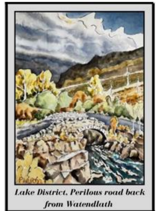
Lake District, Perilous road back from Watendlath

REMEMBER. The market will always follow the money. If in doubt, go back to para one...!